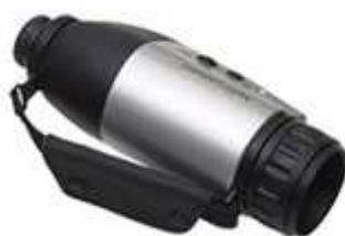
Night Leopard € 360

First generation intensifier tube. Total Darkness Technology