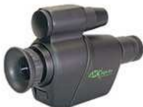
Night Star € 339

Completely waterproof. First Generation Plus tube