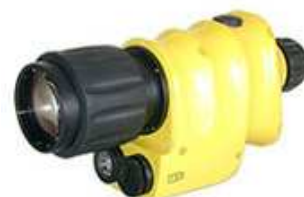
Night Storm Yellow First Gen. € 450 Second Gen. € 1.500

The latest in technology and the newest product in ATN Night Vision Line.