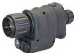
Night Storm First Gen. € 450 Second Gen. € 1.500

Utilizing hard plastic for its outside body, the MO-2 still relies on all glass optics for high light gain and resolution. First Gen.tube.