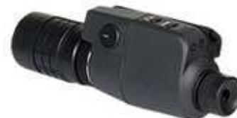
NZT-6 € 339

Our new Night Leopard is a top notch compact night vision monocular. First Generation tube.