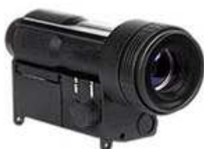
NZT-1 € 299

One of the cheapest scopes in the World!!