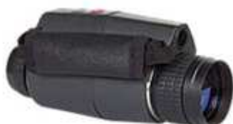
NZT-35 € 339

One of the cheapest scopes in the World!!