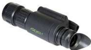
MO2-1 € 409

5x magnification all glass lens system. First Generation tube.