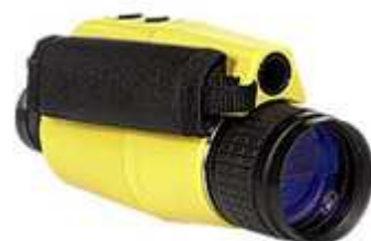
NZT-2W € 339

Simple and economical, with a 1st Generation Plus intensifier tube